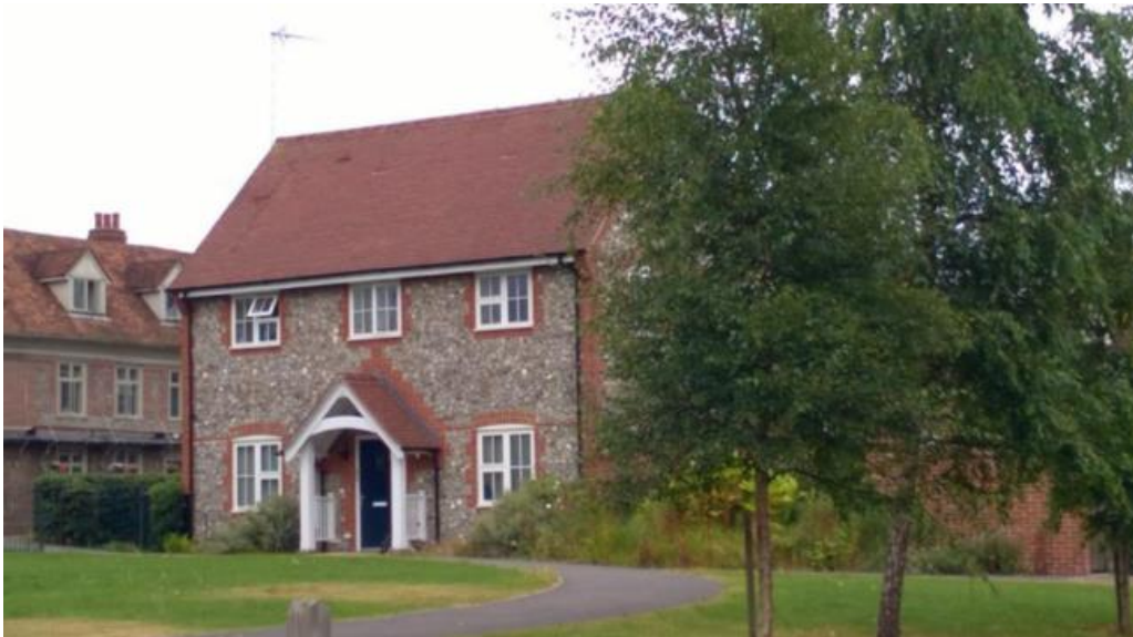
A sensitively designed new development in the Chilterns