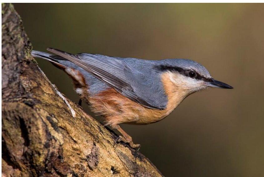
Nuthatch – a key Chiltern woodland species Roy McDonald