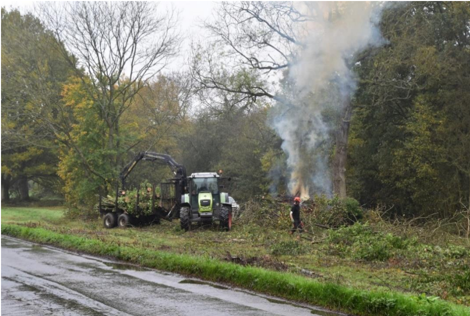
Woodland clearing work to create new woodland edge habitat John Morris, Chilterns Woodland Project