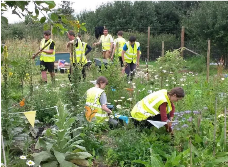
Volunteer work party in action at Lindengate Lindengate