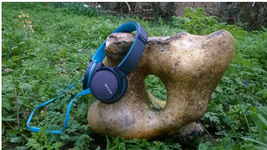
On location, recording the sounds of the Chilterns Charles Pugh