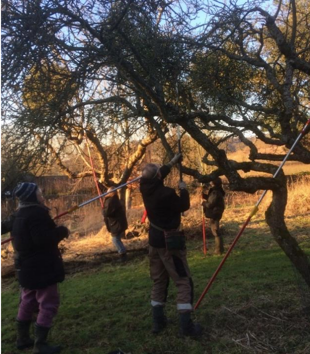
Carrying out vital pruning of fruit trees in a traditional orchard Neil Jackson