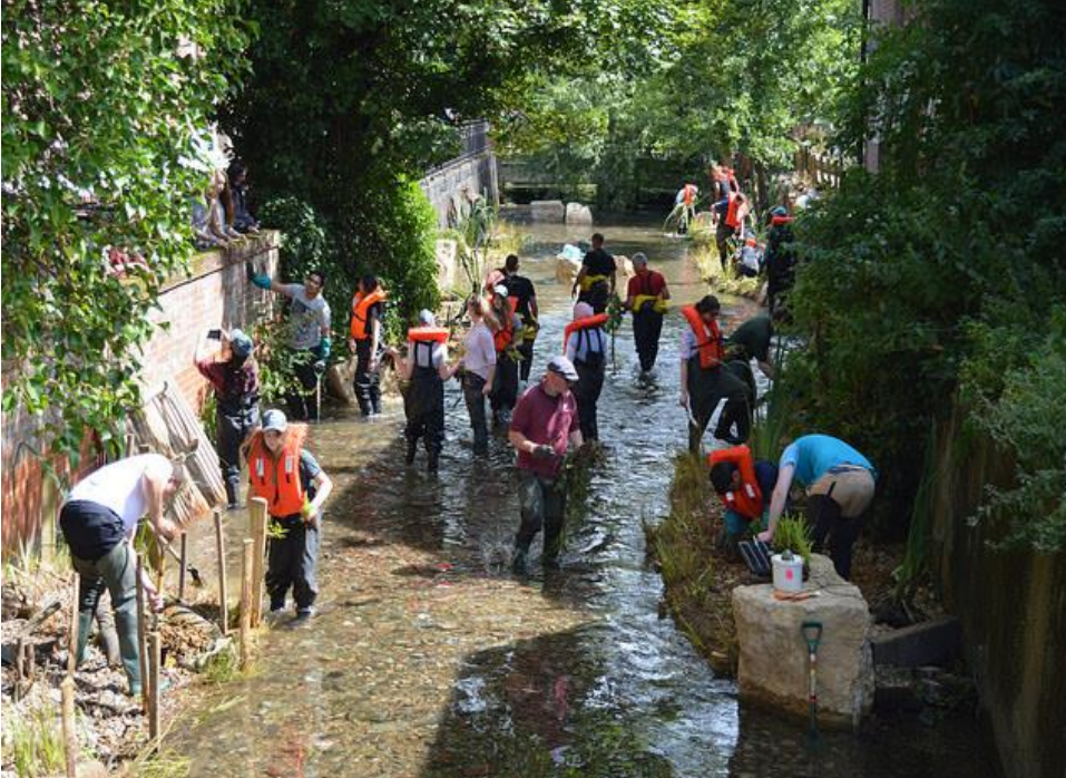
Chiltern Rangers volunteer to clear the River Wye Chiltern Rangers CIC