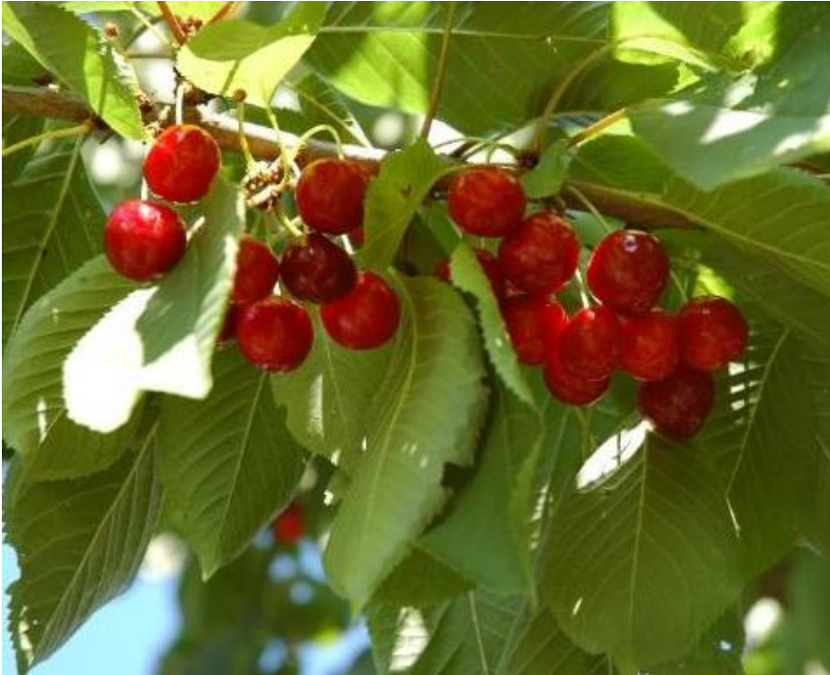
Cherries ready for picking and getting the talk going