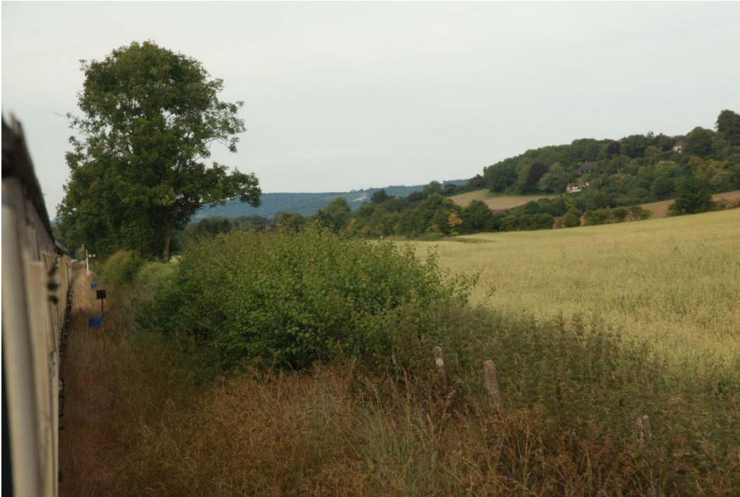
Chinnor and Princes Risborough Railway – the Chiltern landscape ‘on the move’