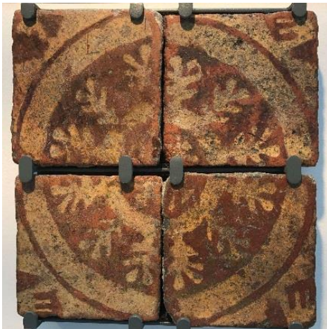
'Penn' tiles held by Amersham Museum Amersham Museum