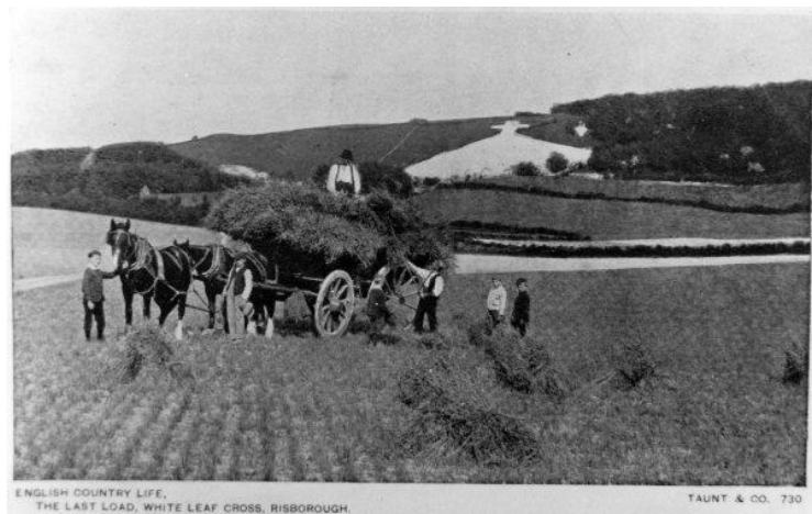
Harvest scene at Whiteleaf, c. 1915.