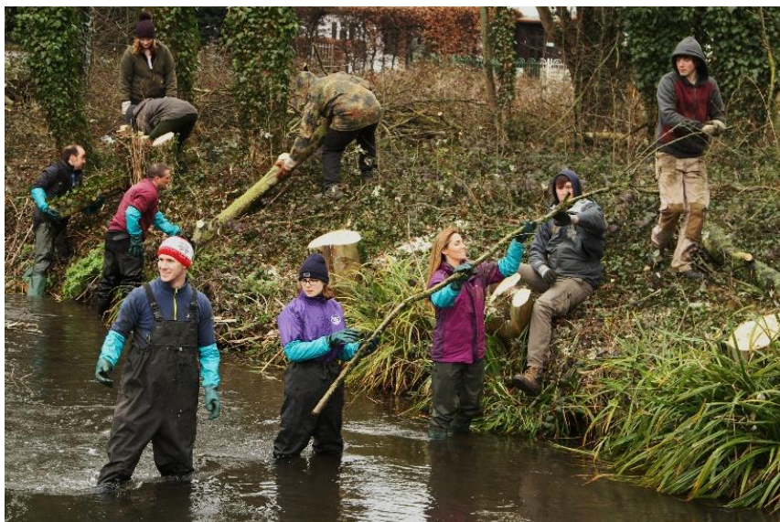
Volunteers get stuck in to clear the river Wye Chiltern Rangers