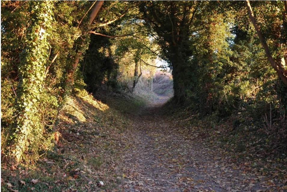
Sunken lane to Grangelands and Pulpit Hill Tracey Adams