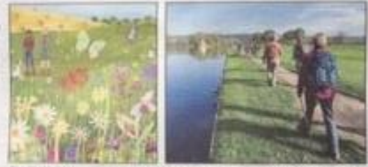
Beautiful landscape greener than ever, and, right walkers making their way along the Thames Path

With a month-long series of events and activities to celebrate nature, the Chilterns Conservation Board is offering a series of walks, picnics and family events to help people reconnect with nature. With a month-long series of events and activities to celebrate nature, the Chilterns Conservation Board is offering a series of walks, picnics and family events to help people reconnect with nature.