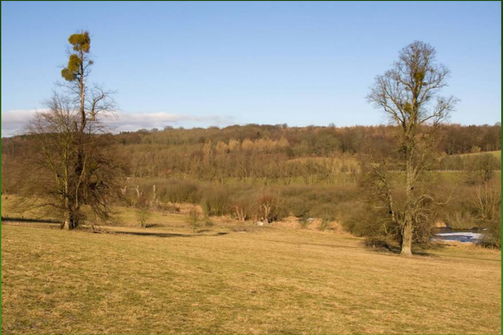
Misbourne Valley, near Shardeloes Lake