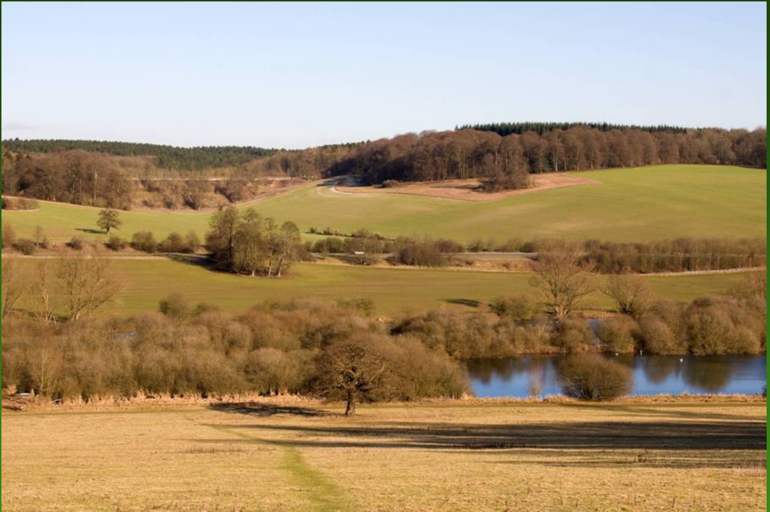
Misbourne Valley, near Shardeloes Lake The railway would be on the surface between the road and Chiltern Line