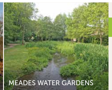
MEADES WATER GARDENS

H Frogmore Meadows: This Nature Reserve, managed by Herts & Middlesex Wildlife Trust is a rare example of a lowland meadow which supports an abundance of grasses, orchids and wildflowers as well as water voles. The water vole is Britain's fastest declining mammal. Once threatened with extinction, the population on the Chess is now healthy again thanks to the efforts of landowners and conservation groups.