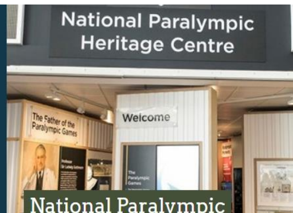
National Paralympic Heritage Centre at Stoke Mandeville

At the birthplace of the Paralympics, learn about how it all began with the inspirational story of Professor Sir Ludwig Guttman.