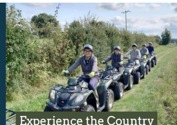
Experience the Country

Experience the Country is an outdoor activity centre and 4x4 off-road training centre set on a beautiful 800 acre estate