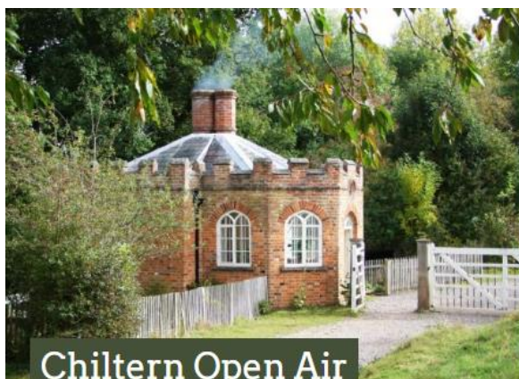
Chiltern Open Air Museum

Browse listings which cater for visitors with accessibility impairments.