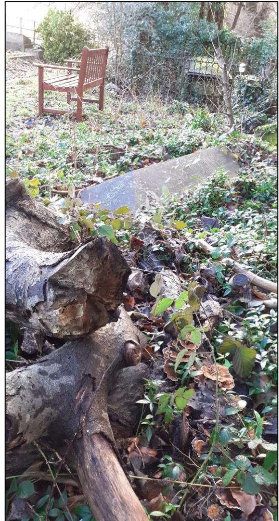
Bench with view across fields and deadwood after management works.

Being able to access the woodland, carry out simple conservation tasks and sow wildflower seed has helped the various volunteers to learn more about wildlife. The church volunteers have talked about the links to the bible and nature, and visitors enjoy walking through the woodland.