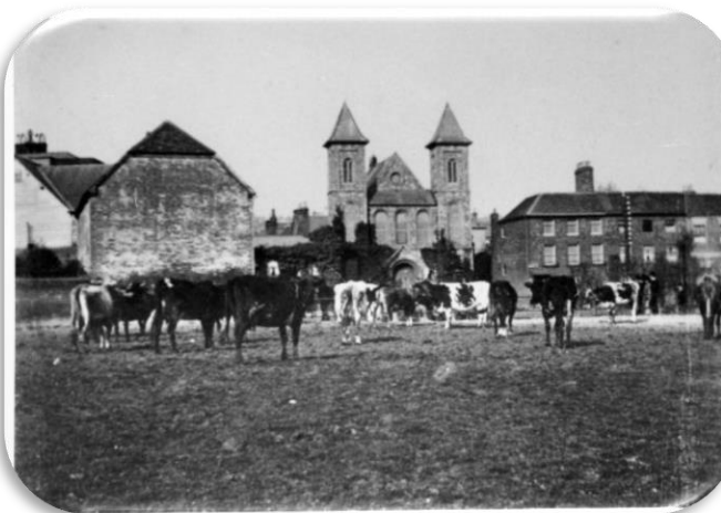
A view of Pann Mill and Trinity Church with cows grazing freely c 1890.

The River Wye has powered corn mills here for over 1000 years, since at least 1086 when it was listed in the Domesday book, a survey undertaken by William the Conqueror. The Panil family owned the mill from around 1150 and gave it the name. Today's Pann Mill is the result of a restoration project by The High Wycombe Society of the original mill's machinery because the earlier building was demolished in 1971 for a planned new road. Due to campaigning by local people, the Rye was saved from being built on. Marks and Spencer gave funds for the existing building and it is open several times a year when you can see flour being ground.