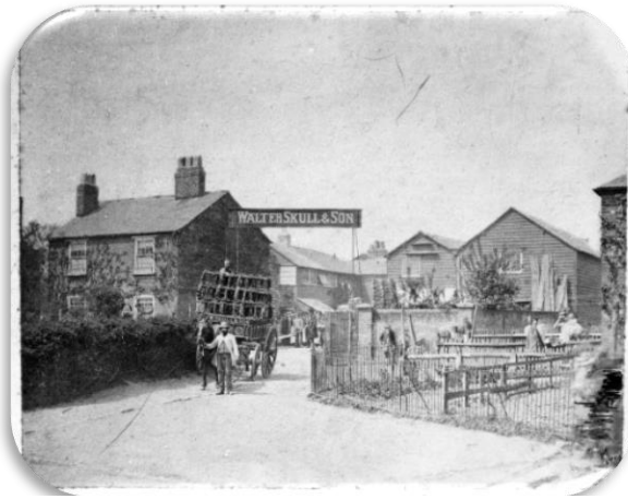
Skulls' Chair Factory, Newland Street c 1875