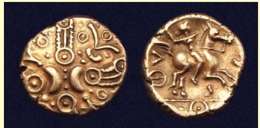
Two gold coins, similar to those found on Keep Hill, dated to about 20BC-AD10

There is a large bank and ditch at the top of the hill which was thought to be the remains of an Iron Age Hillfort. Arrowheads and fragments of an axe head have been found on the hill and are thought to date to the Bronze Age (2300BC – 800BC). In 1827 a boy found a hollowed-out flint that contained 11 gold coins that had been buried between 20BC and AD10, showing that people were living in the area from at least the late Bronze Age and Iron Age (1000BC-43AD) before the Romans arrived in the area.