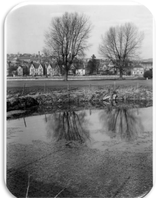
This is the pond or 'Round Basin' as it was known in the c1930s when it was used for growing watercress.

There is a tarmac path that leads back to the Lido and the car park and this marks the old town boundary and the division between the Rye and Holywell Mead.