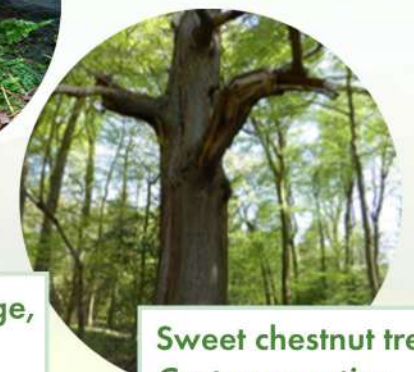
Sweet chestnut tree Castanea sativa