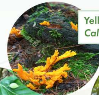
Yellow stagshorn fungi Calocera viscosa

Depending on the time of year, you might see any number of interesting animals and plants on your walk. Listen out for birds like marsh tit, bullfinch and tawny owl. Keep an eye open for frogs and toads, or their tadpoles in ponds. Look for butterflies such as white admiral or purple emperor. Pass through areas of ancient woodland and look for plants including sanicle, wood sorrel, wood barley, bluebell, wild strawberry and wood millet.