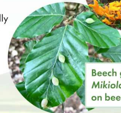
Beech gall midge, Mikiola fagi , on beech leaf