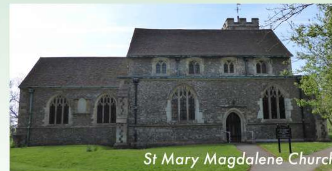
St Mary Magdalene Church

The church of St Mary Magdalene dates mostly between the 14th and 16th centuries, but there is evidence of earlier construction, such as the plain 13th-century doorway and the lower part of the south-west tower.